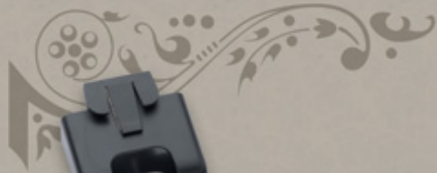
Choke tube box