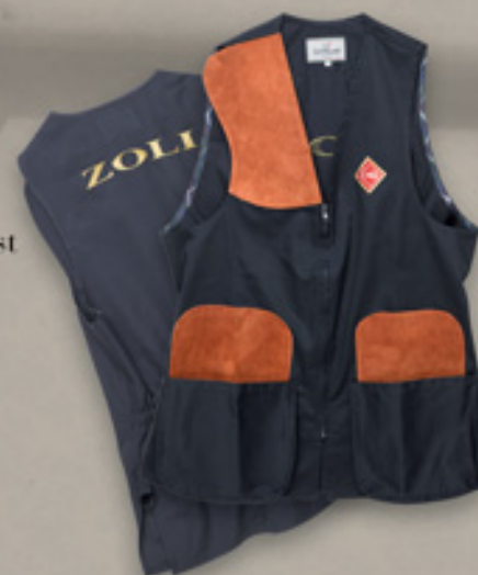
ZOLI Trap vest