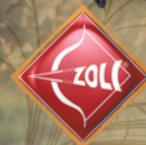
AZ 1900 Bavarian S Battue