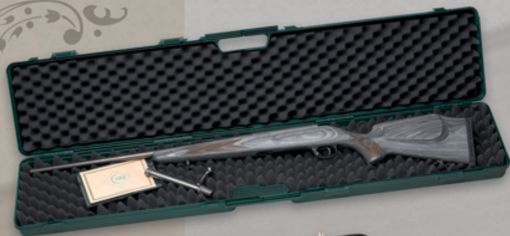
Green ECO case for assembled rifle or shotgun Mod. 1637 SEC