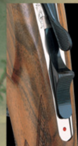
SP hand cocking button.