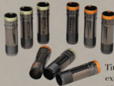
Titanium covered extended chokes for 12ga