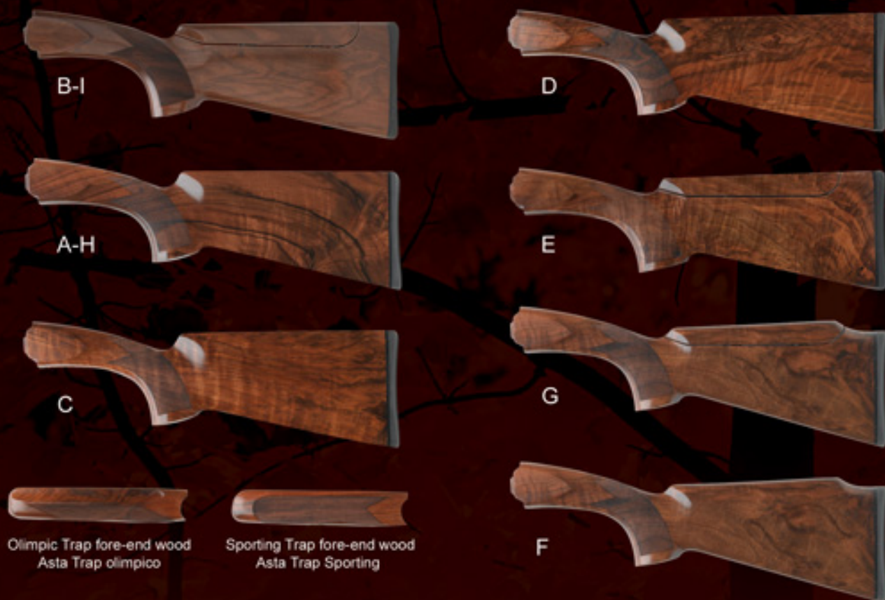
Olympic Trap fore-end wood Asta Trap olimpico