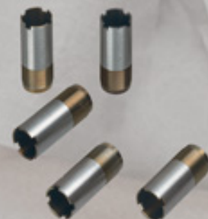
Interchangeable flush chokes for 12-20 and 28ga