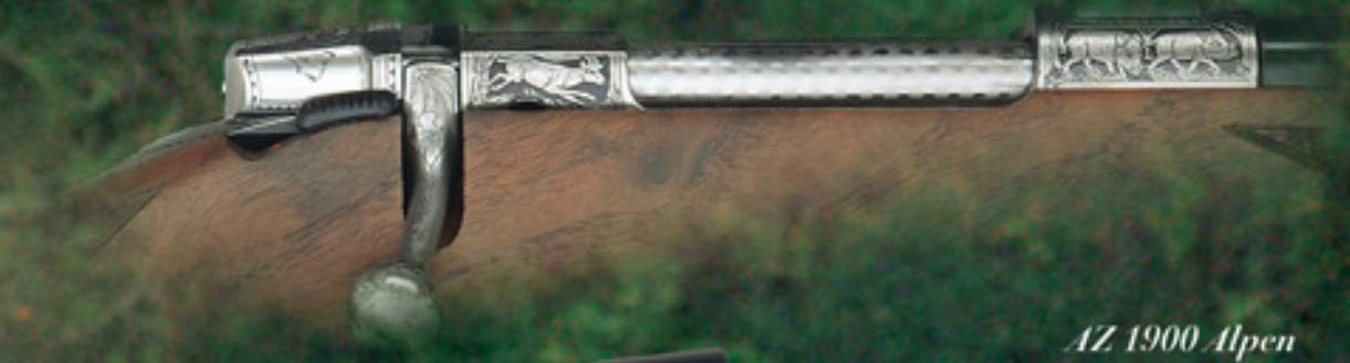
AZ 1900 Alpen

The Alpen features superb game scene engraving with hand touch ups while the Classic comes with traditional English style engraving. "DSS" safety system, high quality wood with inserts in rosewood, wrap-around checkering entirely hand cut, ZOLI logo in relief, innovative set trigger with "ISS" device, detachable sling swivels and top quality finishing are standard on both models. The Alpen and the Classic combine beauty, strength and functionality. The model "Classic" is also available in a left-handed version.