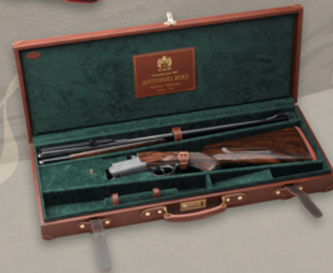
Deluxe leather shotgun case Mod. 405/75 up to 76-cm barrels