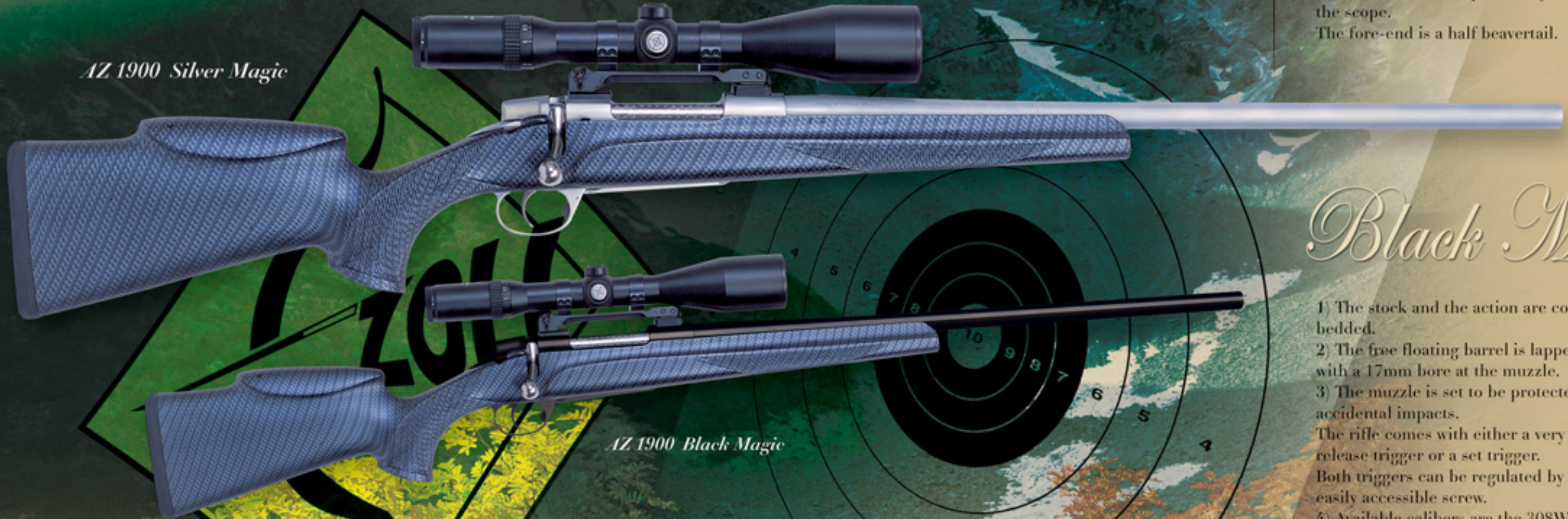
AZ 1900 Black Magic