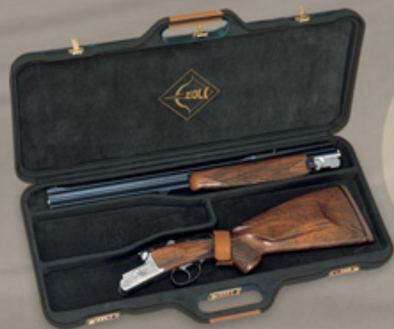
ABS case for double rifles, rifle/shotgun combination gun and drilling with scope compartment Mod. 6/3560 up to 55-cm barrels Mod. 6/3456 up to 65-cm barrels Mod. 1621 for two barrels up to 71-cm Mod. 1673L for 3 barrels up to 76 cm and 2 scopes