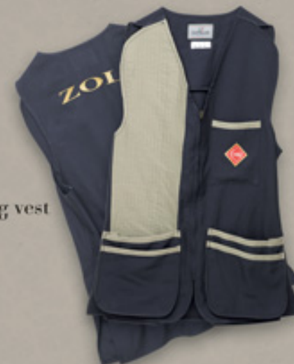
ZOLI Sporting vest