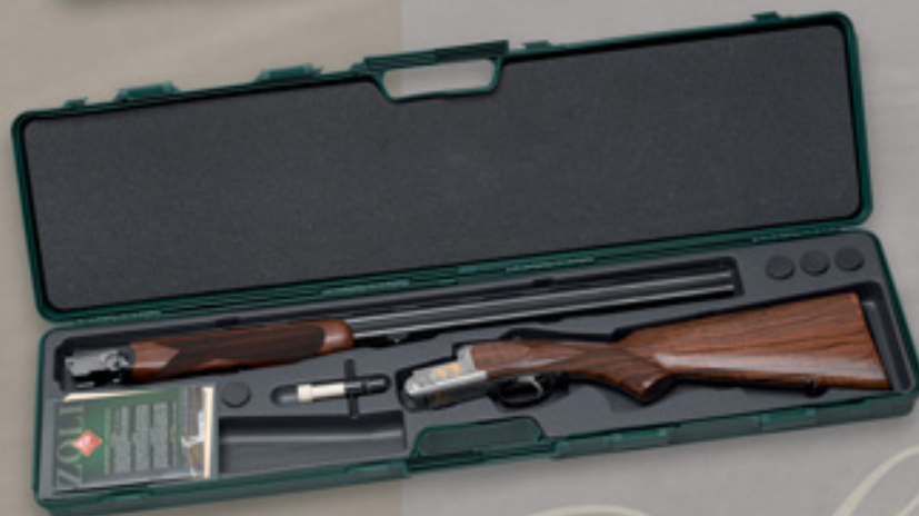
Green ECO case with shotgun contour for barrels up to 75 cm. Mod. 1617ZT/3355