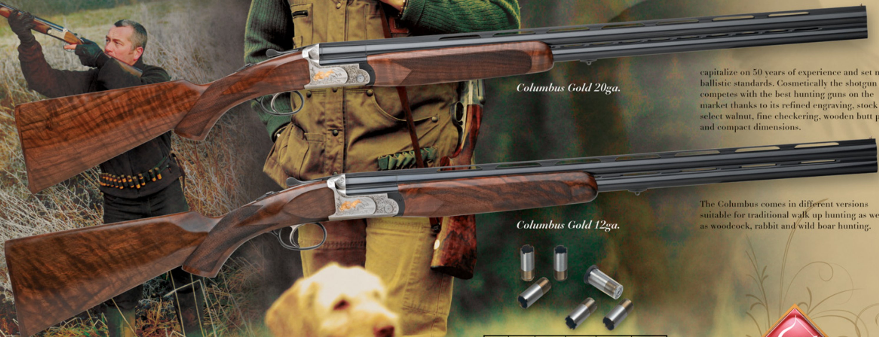
Columbus Gold 20ga.