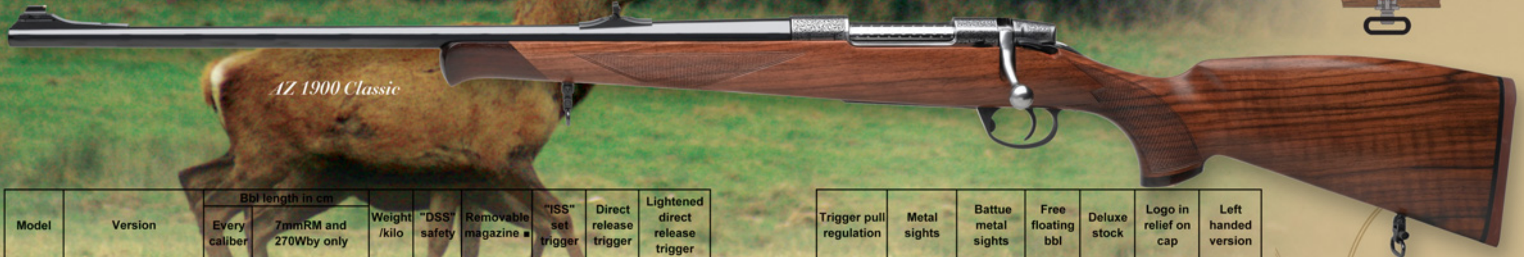
AZ 1900 Classic

The Stutzen is a lighter and easier to handle version of the AZ 1900 rifle suitable for very traditional hunting. The stock extends up to the muzzle where it ends in a Schnabel tip. For improved precision it is no longer fixed to the muzzle by means of a traditional clip but of a spring bush half way down the barrel. The negative effects of dilatation caused by heat are substantially reduced.