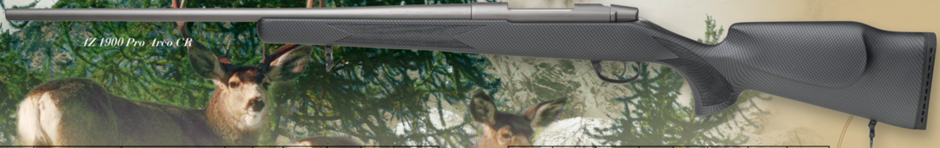
AZ 1900 Pro Arco CR

"Arco" is the name of a special finishing applied on metal parts like locking bolts, frames and barrels for improved looks and weather resistance over the more traditional bluing. The stock on the Pro Arco CR comes with a special rubber coating called "Soft Feeling" which feels good to the touch and protects against the heat.