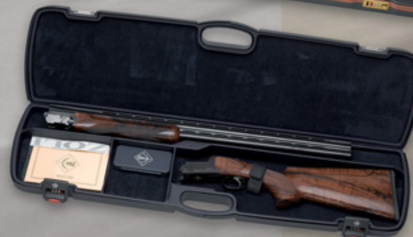
Blue case with shotgun contour and combination locks Mod. 16031 up to 86-cm barrels Mod. 16031/76 up to 76-cm barrels Mod. 16031-2C for 2 barrels up to 81 cm