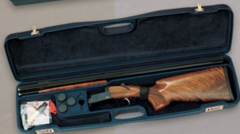
Small blue case with shotgun contour for barrels up to 76 cm and combination locks Mod. 16051