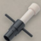
Choke wrench for 12, 20 and 28