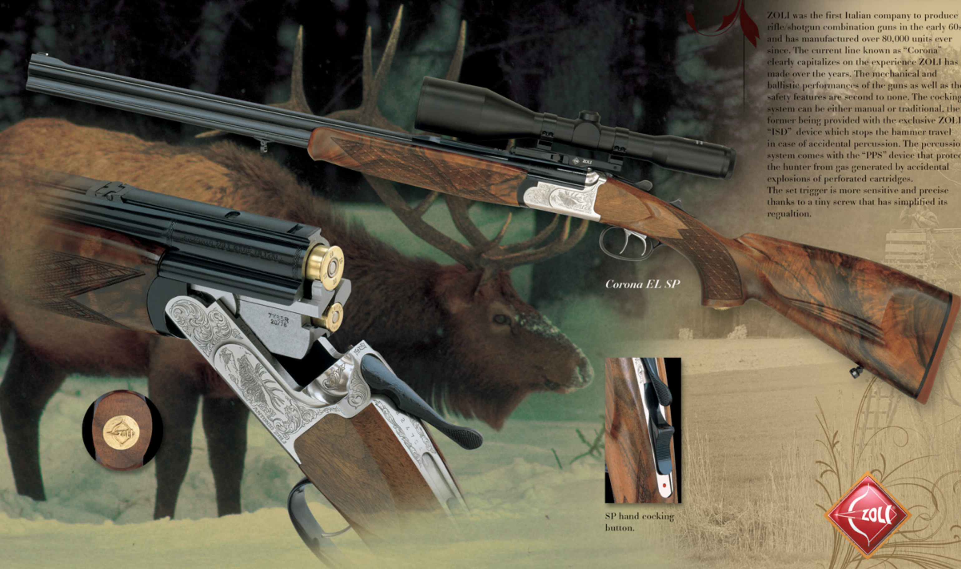
Corona EL SP

ZOLI was the first Italian company to produce rifle/shotgun combination guns in the early 60s and has manufactured over 80,000 units ever since. The current line known as "Corona" clearly capitalizes on the experience ZOLI has made over the years. The mechanical and ballistic performances of the guns as well as the safety features are second to none. The cocking system can be either manual or traditional, the former being provided with the exclusive ZOLI "ISD" device which stops the hammer travel in case of accidental percussion. The percussion system comes with the "PPS" device that protects the hunter from gas generated by accidental explosions of perforated cartridges. The set trigger is more sensitive and precise thanks to a tiny screw that has simplified its regulation.