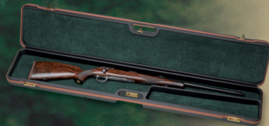
AZ 1900 Super Lux

We have designed the AZ 1900 Super Lux for our most demanding and refined customers who want nothing else but perfection in every detail. The finishing, the hand engraving signed by master engravers combines with the outstanding technical features of the rifle to show our passion and determination and our desire to be known for our style throughout the world. The stock on this rifle features inserts in rosewood and finely hand cut checkering