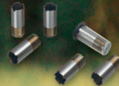
Columbus Gold 12ga.