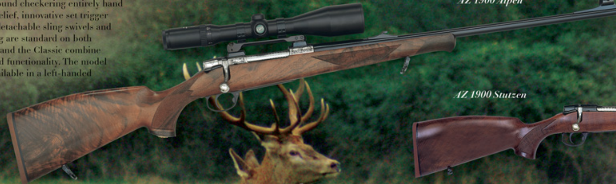
AZ 1900 Stutzen