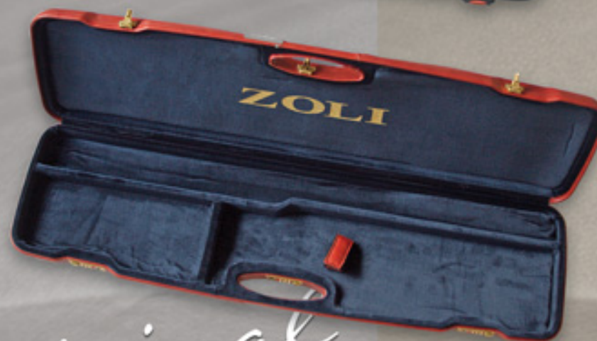
Leather covered shotgun case with combination locks Mod. 1602PL up to 81-cm barrels Mod. 1607PL up to 76-cm barrels