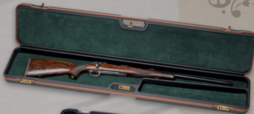
Rifle case in ABS with leather trimmings Mod. 1636LX/3381