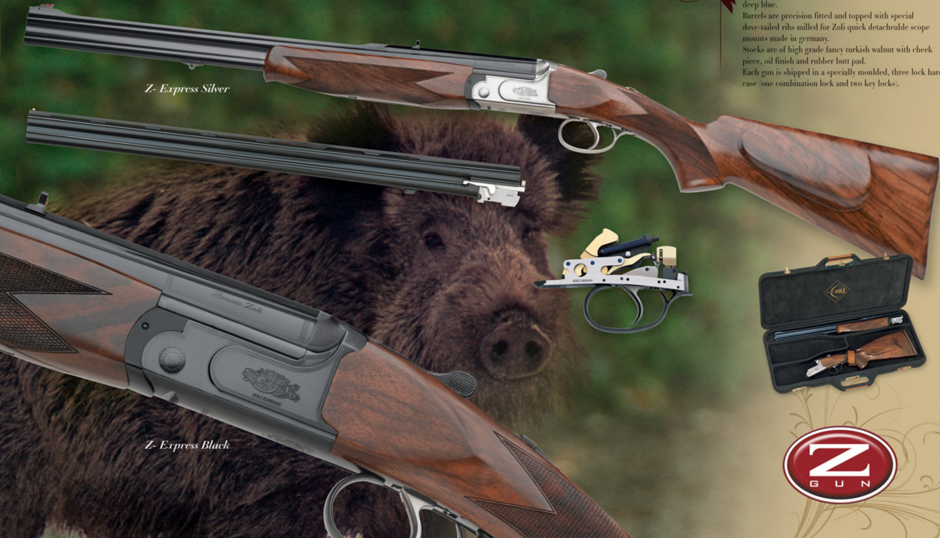
Z- Express Black